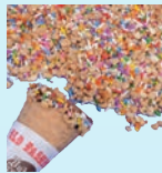
Twinkle Nut Crunch 1/ 10 lb. box