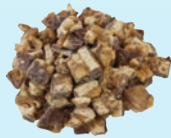
Snickers 2/ 5lb. bags