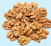
Walnuts 1/ 10 lb. box

* Additional items may be available upon request