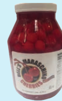
Whole Cherries 4/ 1 gal jars