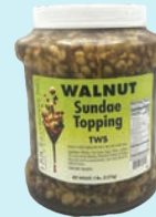
Wet Nuts 6/ .5 gal. jars