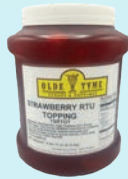
Strawberry Topping 6/ .5 gal. jars.